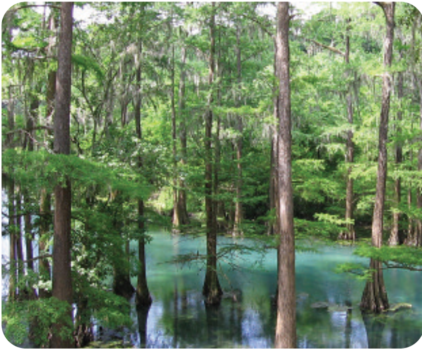
RADON SPRING RUN, KENTON HAYES