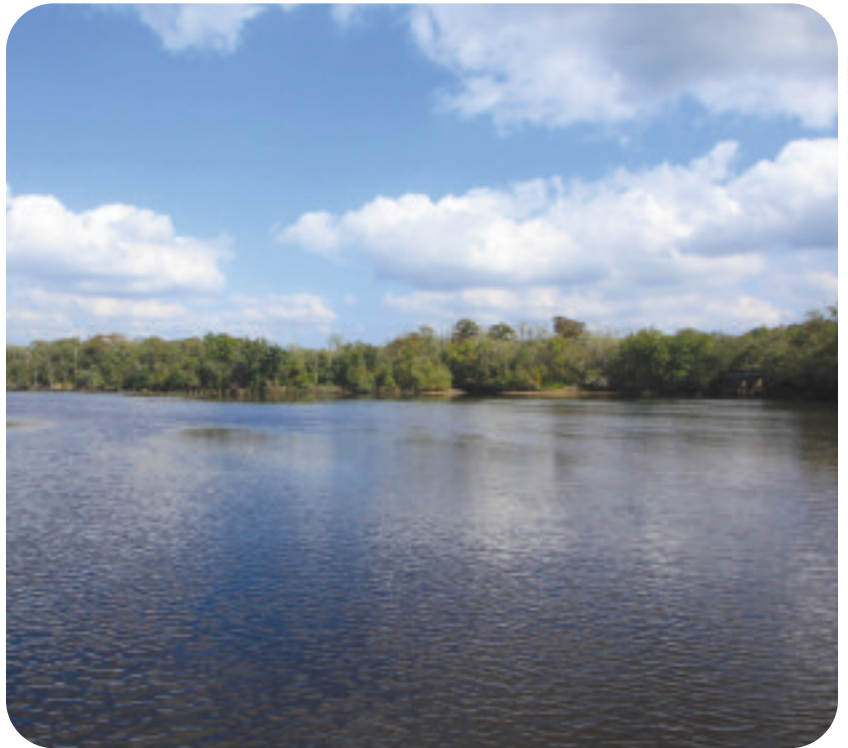
ALABAMA RIVER, ALAN CRESSLER

In 2000, Charlotte-Mecklenburg Utilities (CMU) kicked off its WaterSmart public education campaign to encourage less water waste. In 2003,