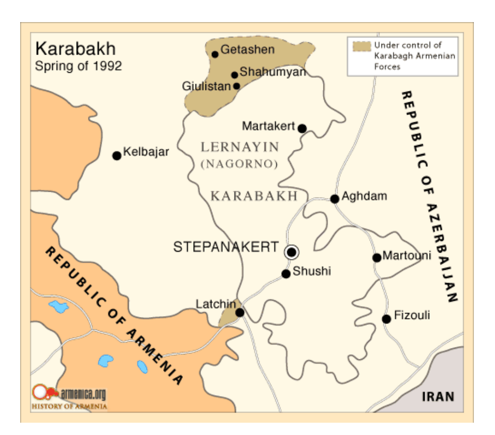
Map 5.2: Latchin corridor and the map of Karabakh

down two conditions to return them back : granting the right of self-determination to the Karabakh citizens and the establishment of a security mechanism in the enclave.